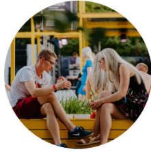
Tartu: Reaching climate goals through sustainable mobility planning