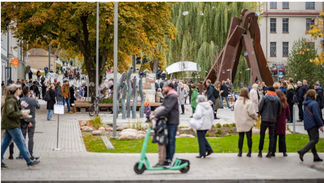
A car street opened up for pedestrians and micro mobility in Vilnius

The challenge of car dominance hindering quality street life, outdoor activities and safe pedestrian experiences in Vilnius needed to be addressed.