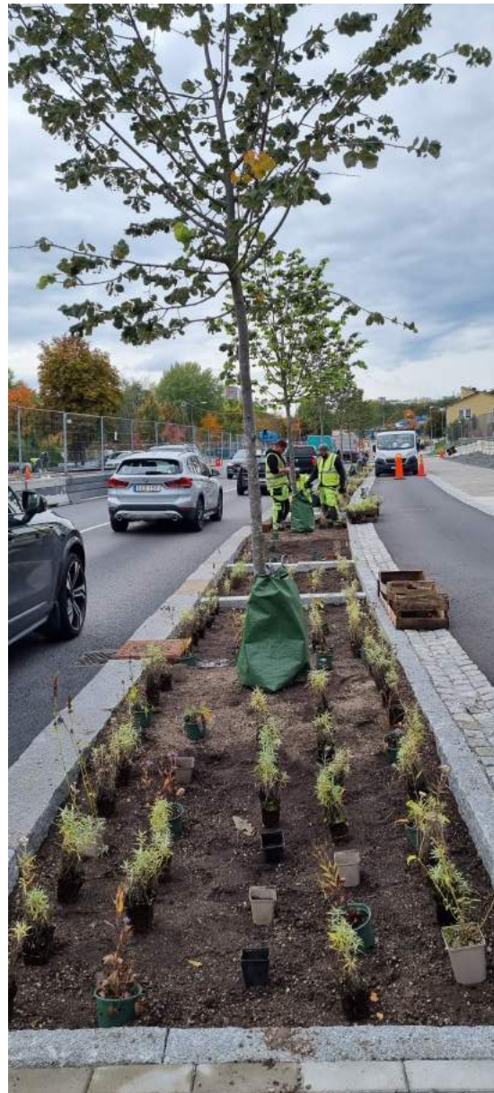
Värmdövägen street transformation

The large thoroughfare has gone from a dividing and segregating road into a public space in the new urban landscape, creating ease of movement for a greater number of target groups and modes of transportation.