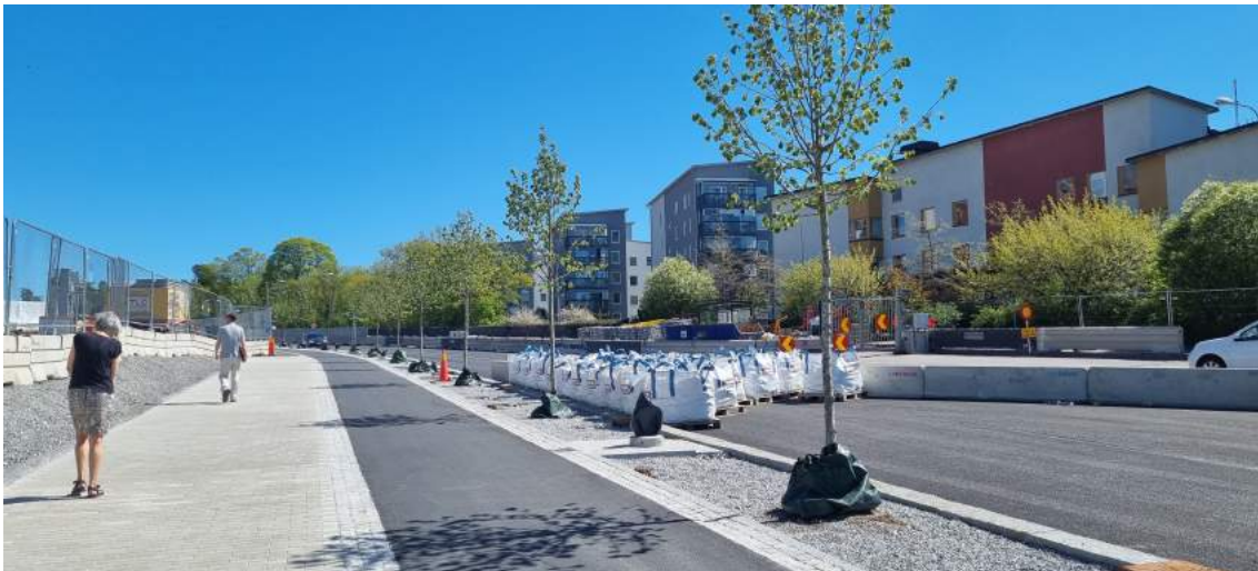
Värmdövägen street transformation