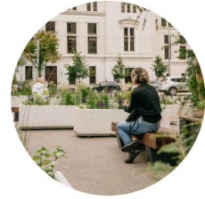
Riga: Transforming a parking lot back into a theatre square