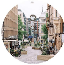
Helsinki: Summer Streets pave the way towards permanent change