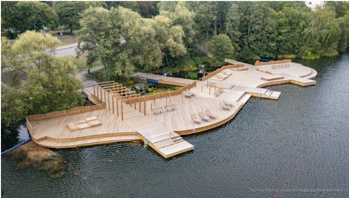
Järlasjö sundeck