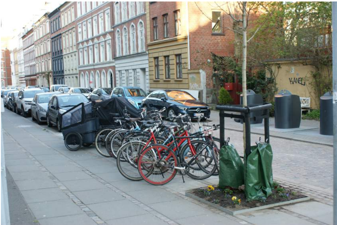
Aarhus Mobility Spot

The two Mobility Points include cargo bike racks and bicycle air pumps and have been highly popular since the opening in November 2019, prompting considerations for additional Mobility Points throughout the city. Trees were planted in both locations in accordance with the city's policy to plant 10,000 trees by 2025.