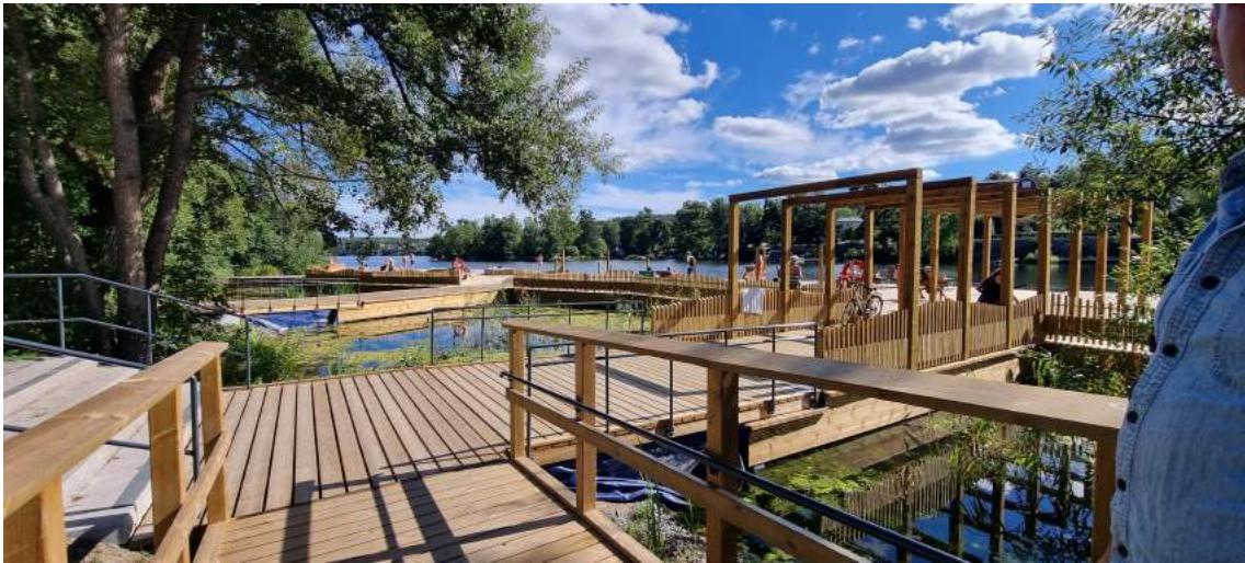
Access to Järlasjö sundeck

The project also shows the benefits of collaboration between different infrastructure projects for common goals that may give space for visitors and citizens to use their environment more efficiently and ensure a better quality of life. The synergy between life quality and function shows an attitude that can be applied everywhere. Citizens demand life quality everywhere and, if taking that demand seriously, even a technicality such as water treatment can be used to improve the urban environment.