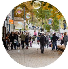
Vilnius: From car focus to society focus