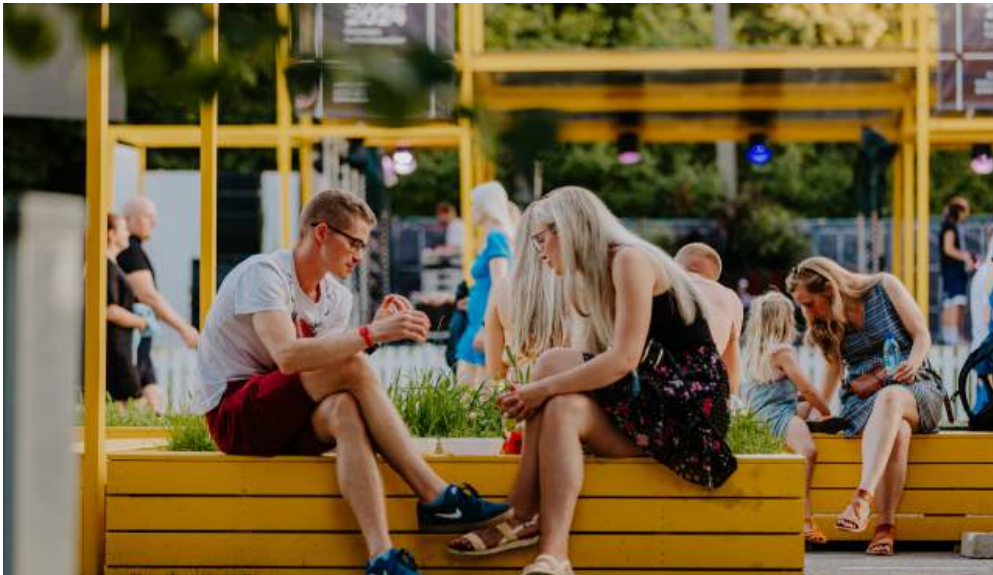
Car-Free Avenue

By mimicking natural plant communities, Tartu's "Curated Biodiversity" project will help green public space and make the greenery more resilient to the harsh urban environment. The Green Index evaluation method also requires private land developers to improve greenery. Since 2022, Tartu started a collaboration with the cities of Aarhus (Denmark) and Riga (Latvia) in a five-year UrbanLIFECircles project to improve liveability in locations across the city.