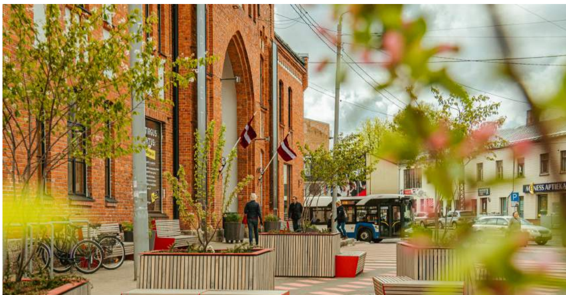
A parking lot transformation in Riga

Over the years, the square in front of the main entrance of the market had transformed to primarily accommodate cars. It was a parking lot and worked as a shortcut for drivers who wanted to skip waiting for the green light at the intersection. This meant that entering the market was challenging and unsafe for pedestrians.