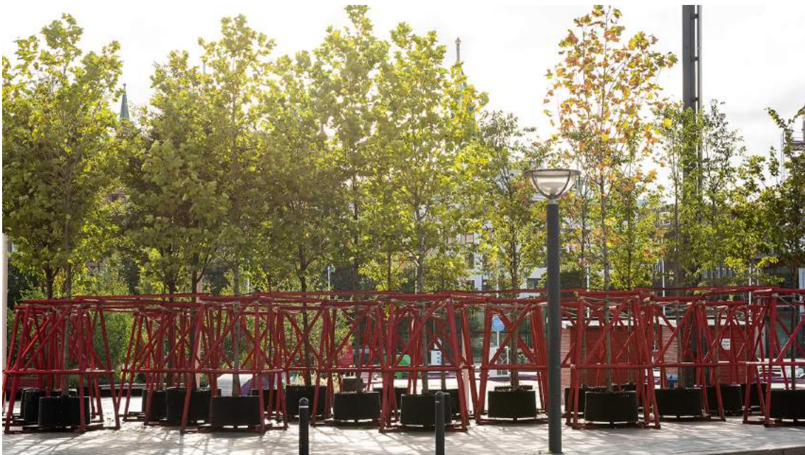
Helsingborg Portable Park

This "Portable Park" project added greenery in public spaces in the city centre that otherwise would have no trees. In addition to promoting a better climate and richer biodiversity, the people of Helsingborg enjoyed the greenery and the beautiful seasonal variations.