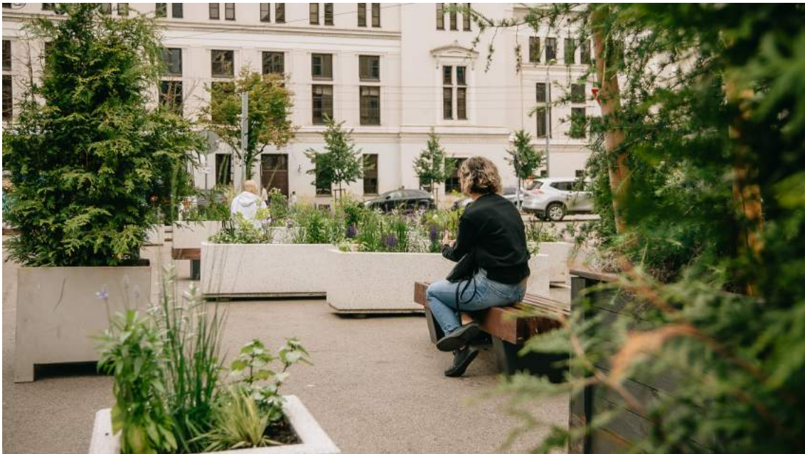
A parking lot transformation in Riga

In summer 2022, the square became a fixed green space in the city, and more benches and potted plants were added. With residents seeing the transformation as a positive change, the square is set to be rebuilt into a fixed green public space, no longer functioning as an illegal parking lot.