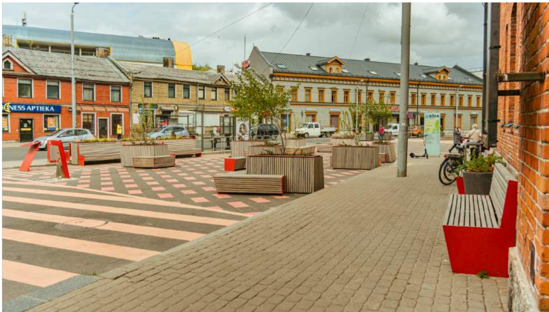
A parking lot transformation in Riga

The square has become more accessible for parents with baby carriages and people in wheelchairs and separated from the street and car traffic by placing flower boxes around the perimeter, therefore making it safer for pedestrians. It is used as a meeting place and a space for public events, and during Christmas time, the neighbourhood's central Christmas tree is placed in the centre of the square, with residents taking part in decorating it.