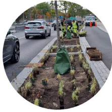
Nacka: Transforming a large road to meet a new urbanisation context