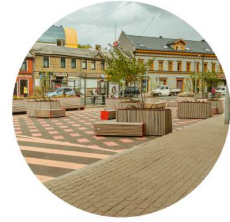
Riga: Transforming a parking lot into the neighbourhood heart