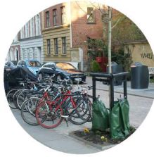
Aarhus: Mobility Points for better multimodality and active travel