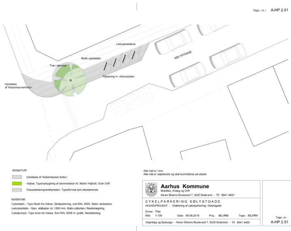
Aarhus Mobility Spot, plan sketch by City of Aarhus

After years of efforts to transform its mobility system, Aarhus has experienced a significant increase in cycling due to improved infrastructure and car-traffic restrictions. However, limited parking for cargo bikes and special bicycles remains an issue in the city.