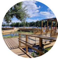
Nacka: Screen basins and sun decks to manage stormwater and rapid urbanisation