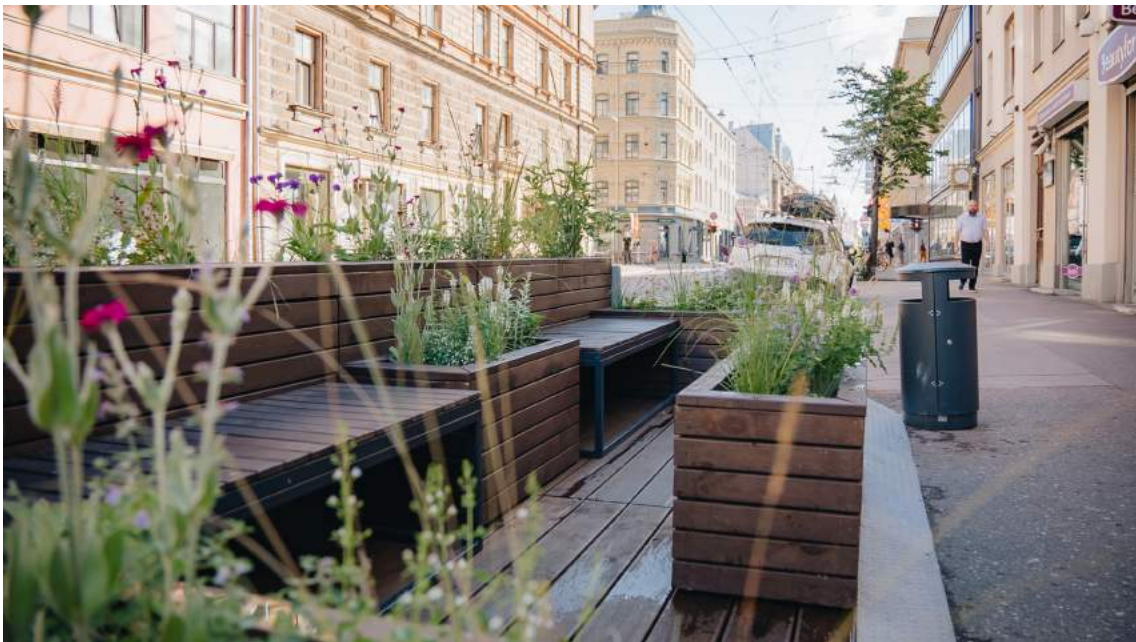
A wooden construction to replace a parking space with greenery and resting places in Riga

In summer 2022, parklets were set up in several streets in the city centre to create green oases for residents to stop and enjoy a peaceful moment in their busy city lives, and over one third of all the outside cafés set up that summer used a standardised design from the catalogue. New designs continue to be added to the catalogue, which the municipality itself uses to reclaim public space from cars.