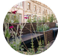
Riga: Standardised parklets to create green street oases