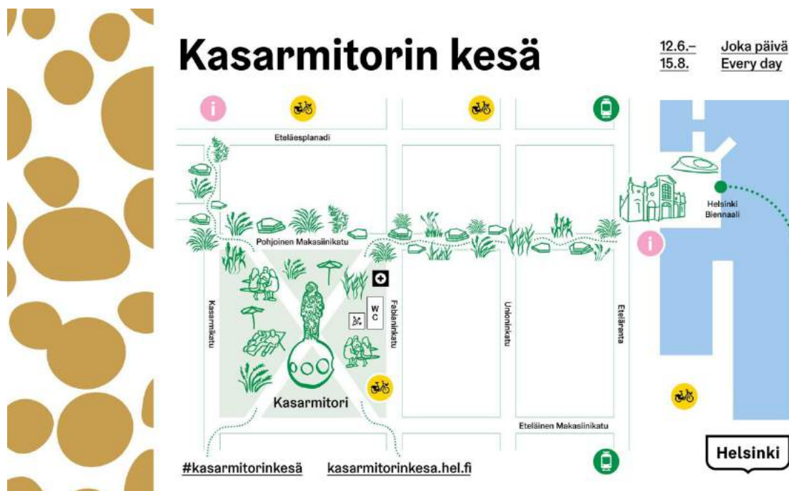
A map over Helsinki summer streets, graphic by Helsinki Municipality

In the summer of 2021, a pilot programme was launched in Helsinki to turn two streets, Kasarmikatu and Pohjoinen Makasiinikatu, into temporary slow streets in woonerf style. These “summer streets” included street furniture, wooden islets, lush greenery, parklet terraces set up by local restaurants and other traffic-calming measures. The two streets were connected to the Esplanadi park and the city centre, and an additional “summer terrace” was set up on the Kasarmitori square with 12 restaurants and 560 seats, helping create a vibrant atmosphere in the city.