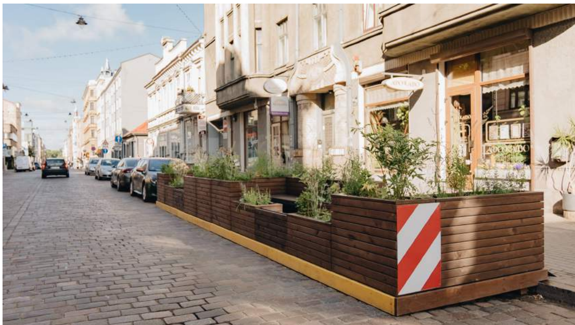
A wooden construction to replace a parking space with greenery and resting places in Riga, photo by Riga Municipality

Meanwhile, the COVID-19 pandemic hit the food service industry hard, as government restrictions only allowed outdoor seating. One solution adopted in many cities was to allow the installation of temporary restaurant terraces, but narrow sidewalks and bureaucratic approval still made it hard for restaurants and cafés in Riga to survive.