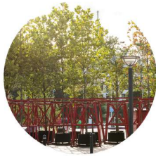
Helsingborg: Portable parks as a flexible solution to green the city