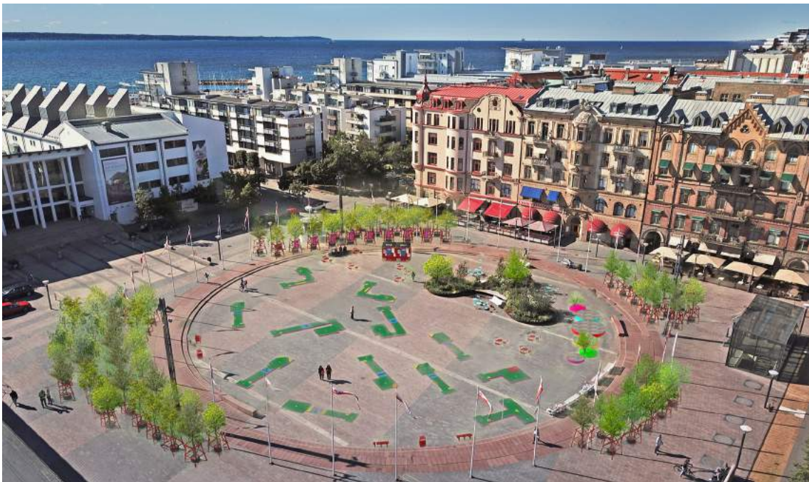
Helsingborg Portable Park

Helsingborg has ambitious plans to transform into a more sustainable city that is also both a liveable and an attractive place for its residents. To do so quickly and cost-efficiently, Helsingborg has been testing flexible solutions to create resilience for the sometimes unknown needs of the citizens. By integrating "new learning as we go," the city gathers citizen input at an early stage before (expensive) permanent decisions are made.