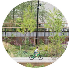
Copenhagen: Urban climate adaptation and neighbourhood transformation