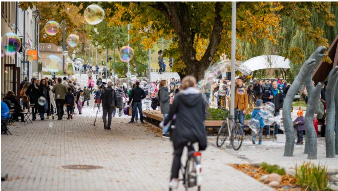
A car street opened up for pedestrians and micro mobility in Vilnius, photo by Saulius Žiūra, Vilnius City Municipality

Collaboration with the museum led to the extensive display of existing and newly designed sculptural pieces introduced to the wider setting as an open-air gallery. Artists found their unique ways of integrating their pieces into the streetscape and new pedestrian circulation patterns.