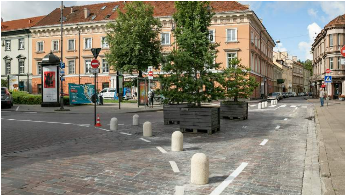
Old town streets were opened up for pedestrians and micro-mobility, while car and heavy traffic was limited

Driving in the Old Town is allowed only to homes, workplaces and attractions within the same loop. Access is available via smaller streets belonging to one of the four main loops. Information is provided at each entrance and online, and an app provides traffic data.