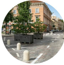
Vilnius: Traffic loops as steps towards low-pollution zones