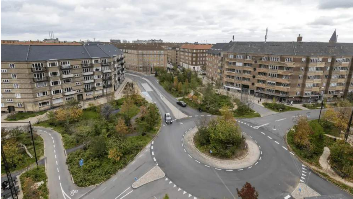
Sankt Kjelds Square roundabout

Adaptation measures in Copenhagen must not compromise the city's environmental standards. The aim of climate adaptation measures in Copenhagen is to further reduce sewer overflows during heavy rainfall by separating rainwater from the sewers and preventing discharge into streams, lakes and the sea. In the future, Copenhagen residents would be able to swim in the harbour.