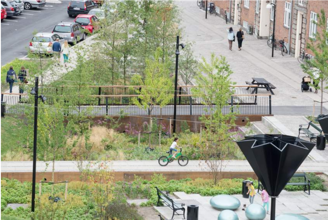
Tåsinge Plads

With around 15,300 m 2 of road area, the area previously had no nearby places for residents to meet or walk. The road area has now been optimised to 5,600 m 2 , ensuring mobility efficiency while transforming the rest of the area into green space for locals to stroll and enjoy the sound of birds.